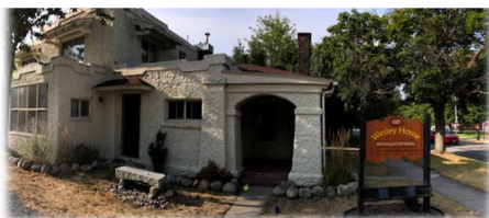
1327 Arthur Ave. (on the corner of Arthur and Keith across from Miller Hall)